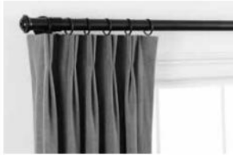
2-FINGER EURO PLEAT