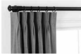
3-FINGER EURO PLEAT